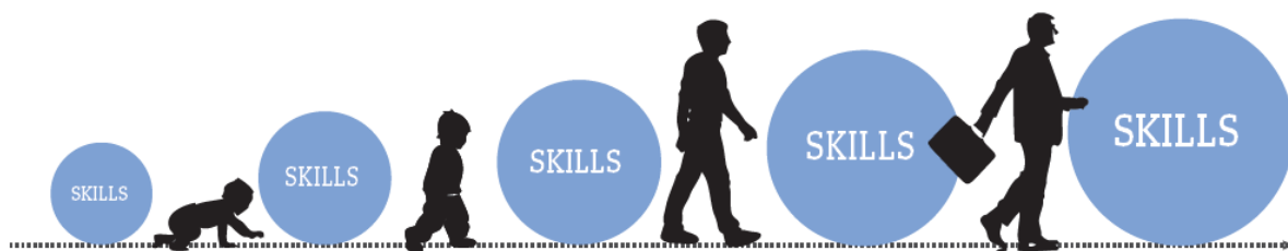
Figure 2.2. Skills development over a lifetime

The rate of skill development largely depends on the individual's age and on their current level of skills. It is now recognised that there are sensitive periods for skill development. A child's early years matter tremendously in the development of skills, as they lay the foundations for future skill development. Investment in early childhood interventions brings the biggest returns in terms of securing higher levels of skills and positive adult outcomes (Kautz et al., 2014). During these years, family is of crucial importance and the patterns of interaction between parents and children have significant impacts on cognitive, social and emotional skills. However, later interventions can also be effective, especially in terms of social and emotional skills (OECD, 2015). During middle and late childhood and adolescence, schools, peer groups, and the community become increasingly important influences in shaping these skills. In addition, alternative programmes for those who drop out of school (i.e. in-work training) have also been found to be important for later skill development (Kautz et al., 2014).